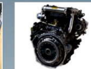
ISUZU 4HK 1TC 173 PS Engine