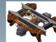
Rear Air Suspension