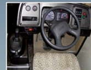
Ergonomically Designed Driver Console

New Concept luxury Bus is a brand new product developed especially for International Bus Market. With all the robustness and reliability to make it the perfect Bus, FR 1318 combines Style, Safety, Performance and Comforts in harmony to make journeys 'Memorable'.