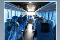
Deluxe Reclining Seats