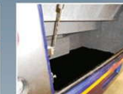
Big Boot Space at Rear for more Luggage.